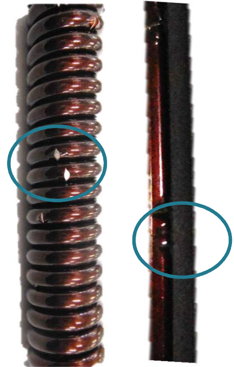
Wire from other supplier on 2xd winding and after 35% flattening - KO

Comparison tests with other enameled wires shown the superior performances of ADHEXAL products.